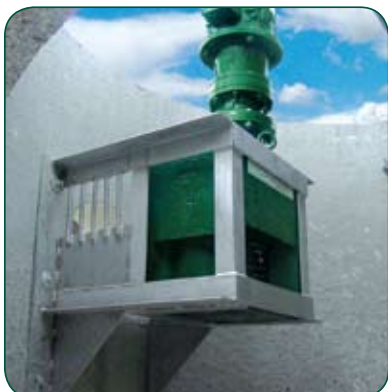
Mini Monster installed in a pump station