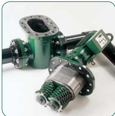
Easy to remove cutter cartridge

For low flow, buildings and small pump station applications the Mini Monster is a reliable grinder in a small package. It grinds wastewater to eliminate costly pump problems and sewer back-ups.