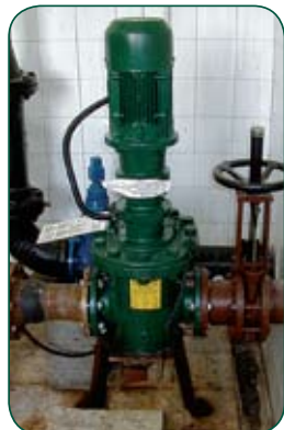
In-line Mini Monster