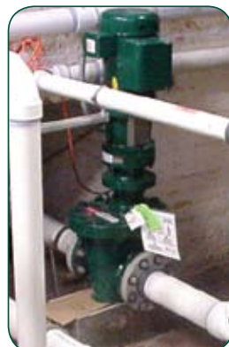
In-line Mini Monster